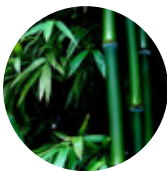
North Latitude 30°Alpine Bamboo