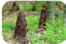
HUMAN'S FOOD—BAMBOO SHOOTS