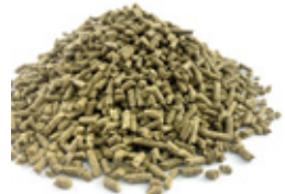
BAMBOO & MUGWORT CAT LITTER