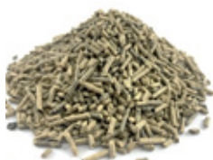
CHARCOAL BAMBOO CAT LITTER