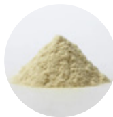
Fresh Bamboo Powder