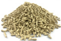
FRESH BAMBOO CAT LITTER (ORIGINAL COLOR)